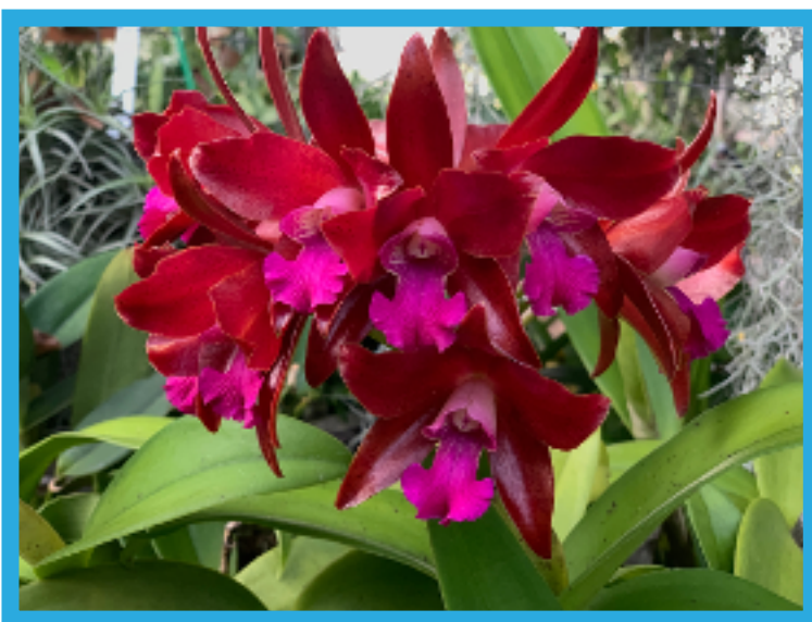
Lc. Sagarik Wax 'Silk Ball' AM/AOS