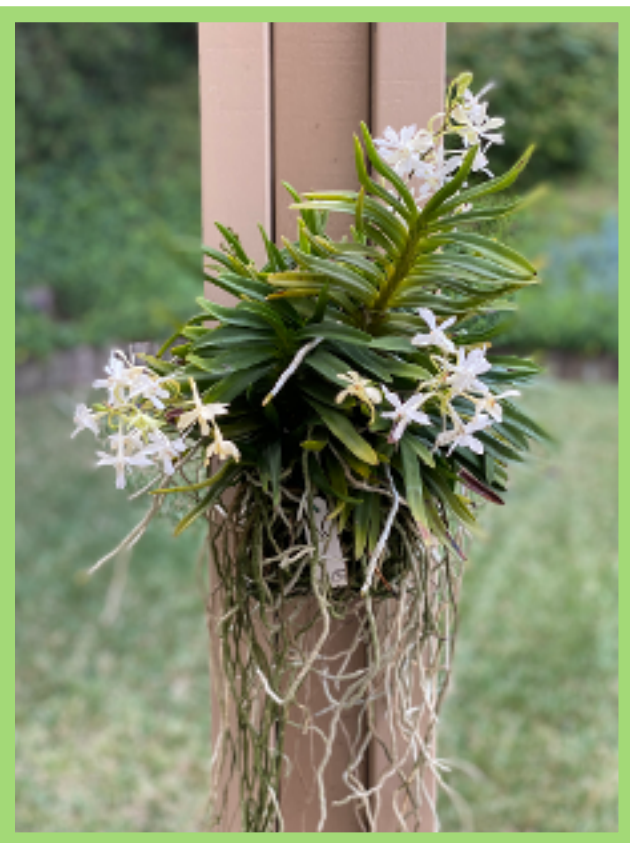
Chrisnetia (V.) Green Light