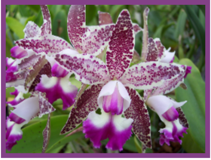
C. Tian Mu 'Sesame'