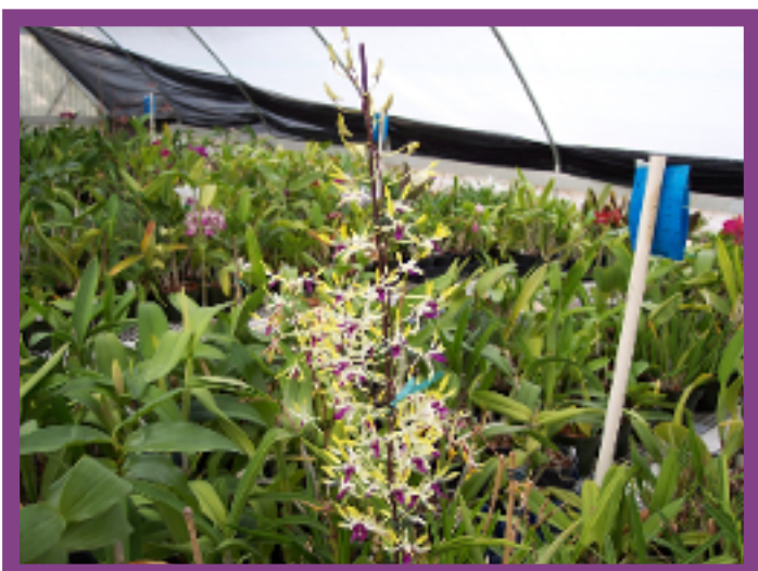
Den. Pixie Princess