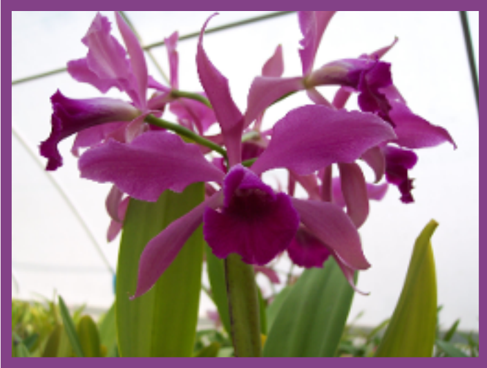
C. Elegans 'Sanguiana'