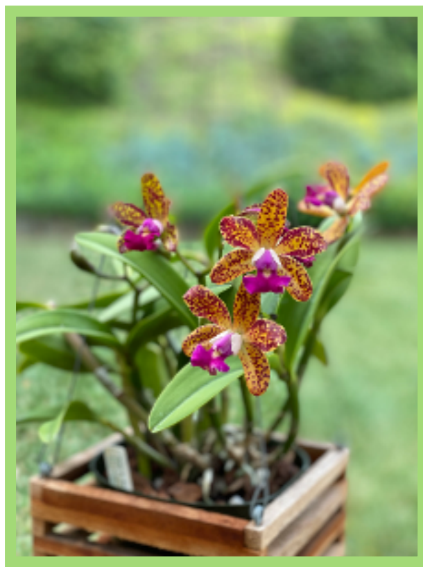
C. Mark Jones x Slc. Jungle Elf