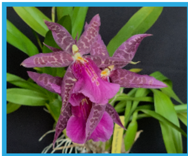
Mtssa. Dark Star 'The Orchidworks'