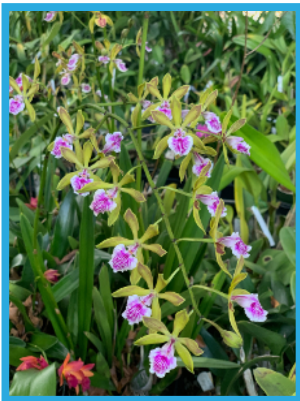
Enc. (plicata x gracile) x Enc. Grand Bahama]