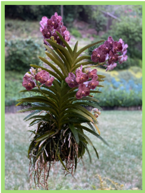
Ascda. Kulwadee Fragrance