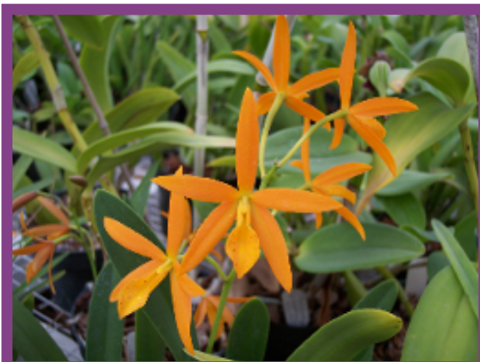
Pcv. Golden Peacock.