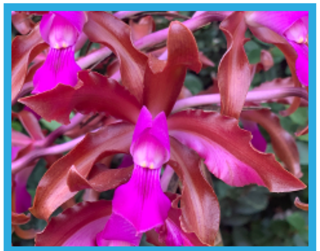
Lc. Cherry Plum with close up