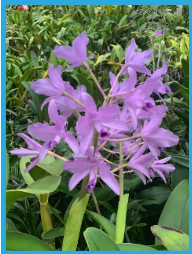
C. bowringiana v. coerulea 'Blue Angel' HCC/AOS