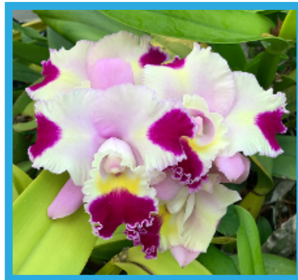
Lc. Orchid Affair