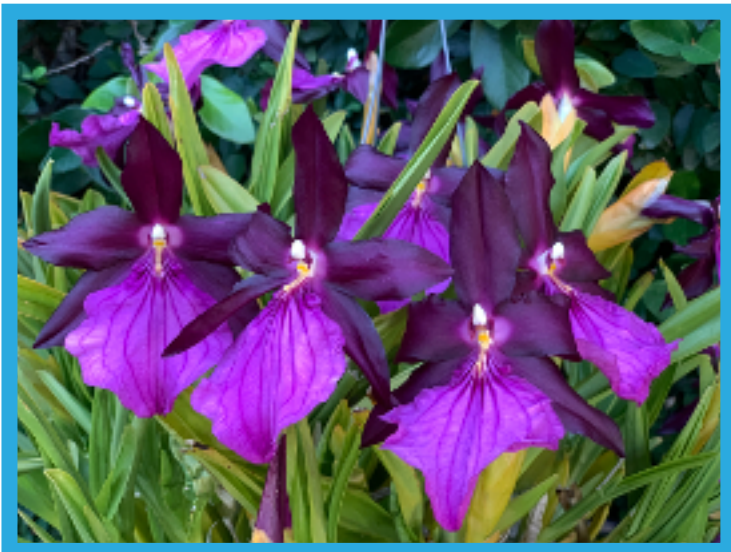
Miltonia spectabilis v. moreliana