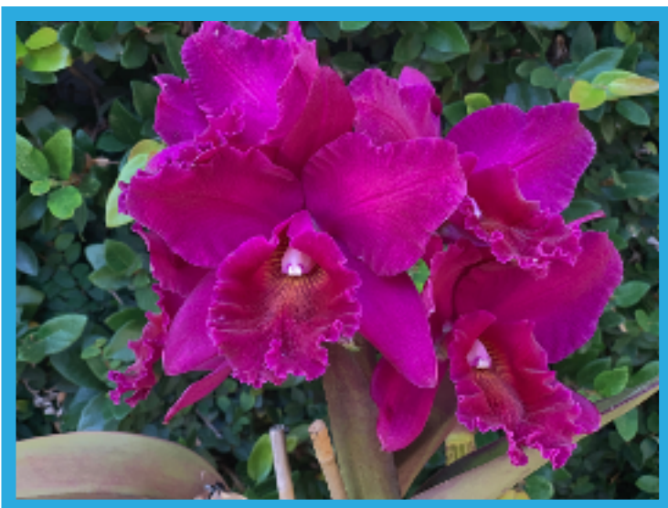
C. Lochinvar 'Black Knight'