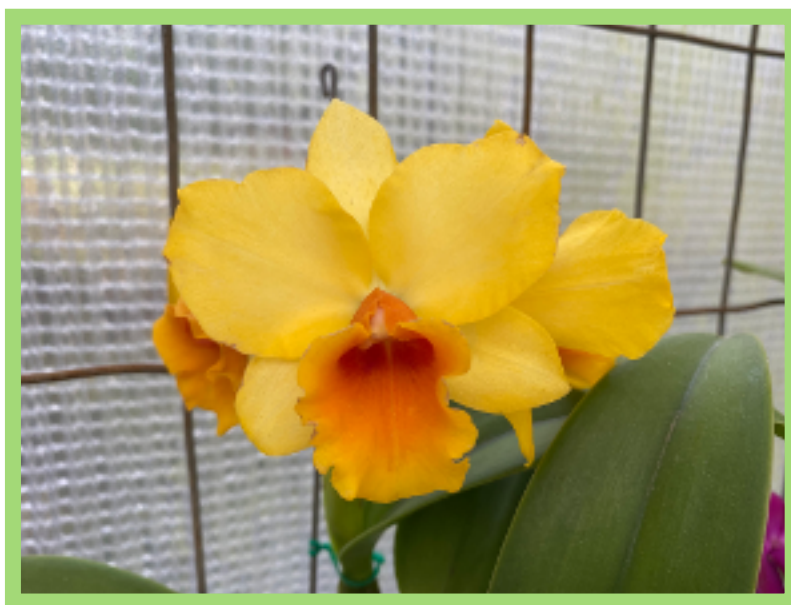
Blc. Kaboom x Pot. Golden Circle