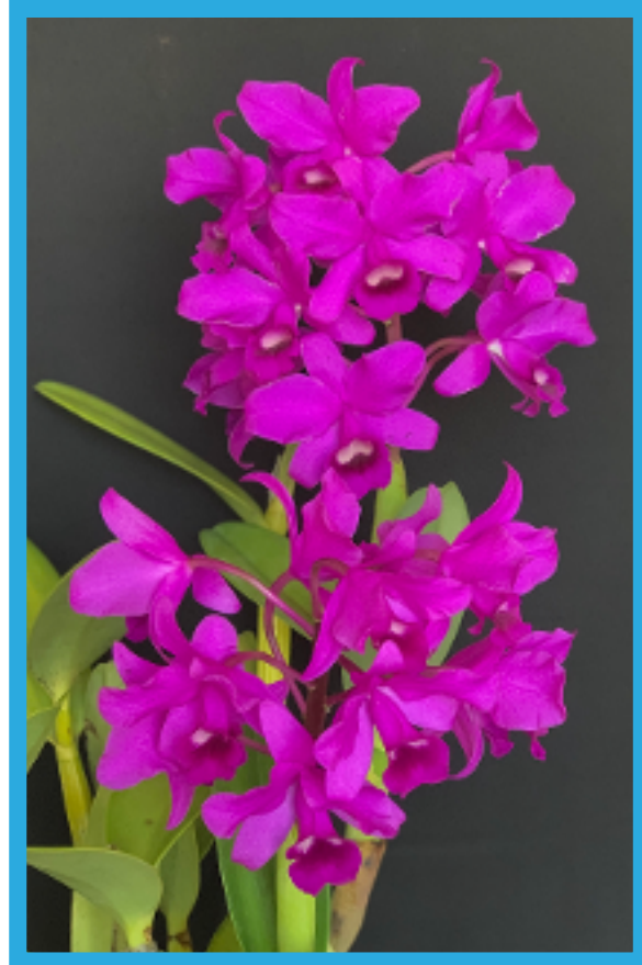
C. bowringiana ('MAJ' x 'Black Prince')