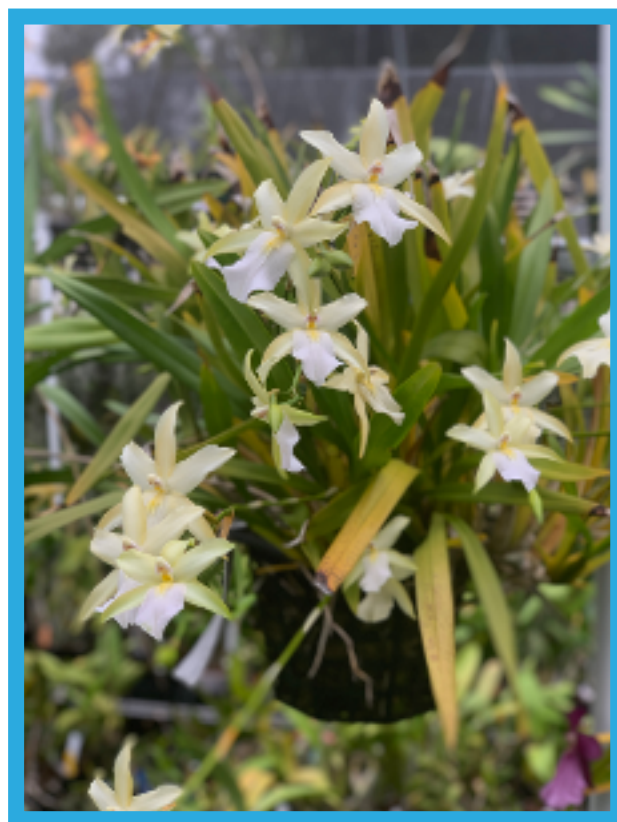
Miltonia regnellii v. alba